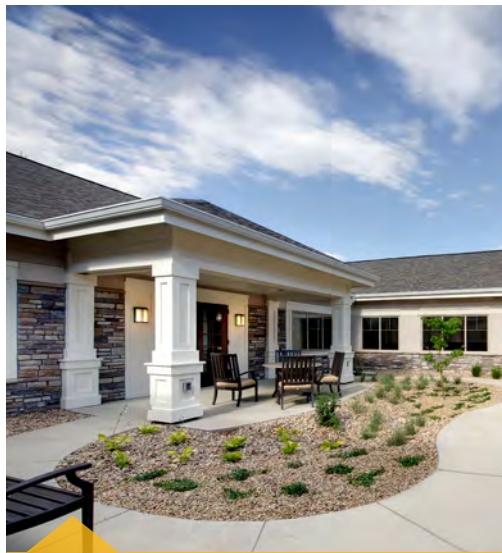
LAKWOOD MEMORY CARE