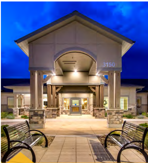
WINDSONG AT ROCK CREEK