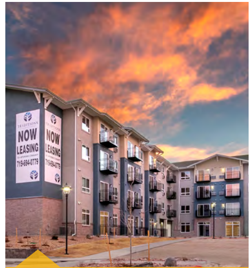
TRADITIONS AT COLORADO SPRINGS