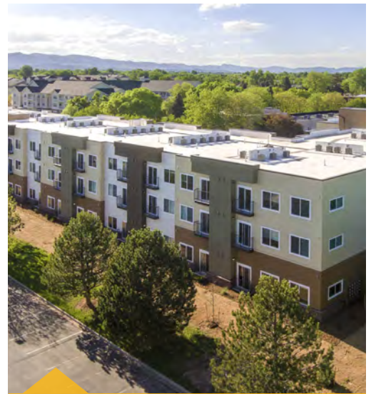
OAKRIDGE CROSSING SENIOR LIVING COMMUNITY