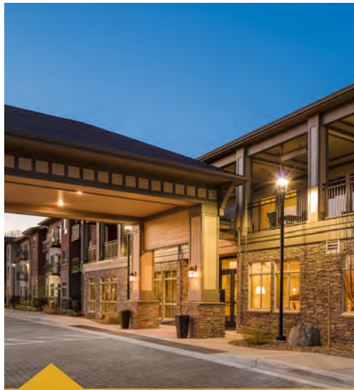
AFFINITY FORT COLLINS